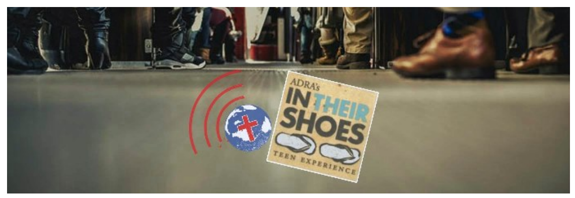
Global Youth Day is set to launch the official week of the Youth Week of Prayer meetings.