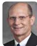
TED N. C. WILSON IS PRESIDENT OF THE SEVENTH-DAY ADVENTIST CHURCH.