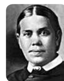
THIS ARTICLE HAS BEEN EXCERPTED FROM PAGES 139-160 OF THE BOOK THE MINISTRY OF HEALING (MOUNTAIN VIEW, CALIF.: PACIFIC PRESS PUB. ASSN., 1905). SEVENTH-

DAY ADVENTISTS BELIEVE THAT ELLEN G. WHITE (1827-1915) EXERCISED THE BIBLICAL GIFT OF PROPHECY DURING MORE THAN 70 YEARS OF PUBLIC MINISTRY.